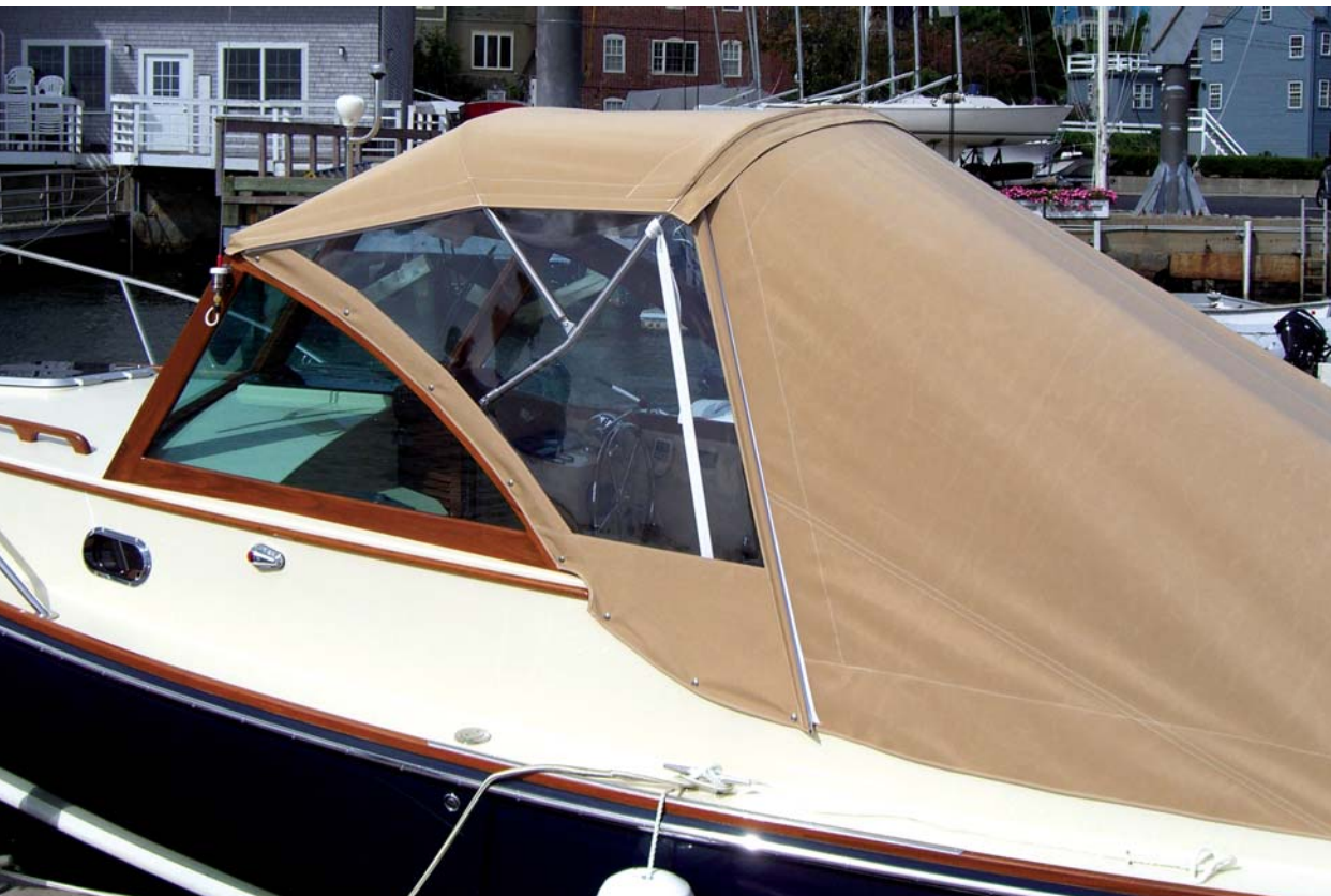
A CW Hood Yachts Wasque 26 outfitted with Hood Canvas and our project aft cover. Notice the stitch lines on the aft cover.