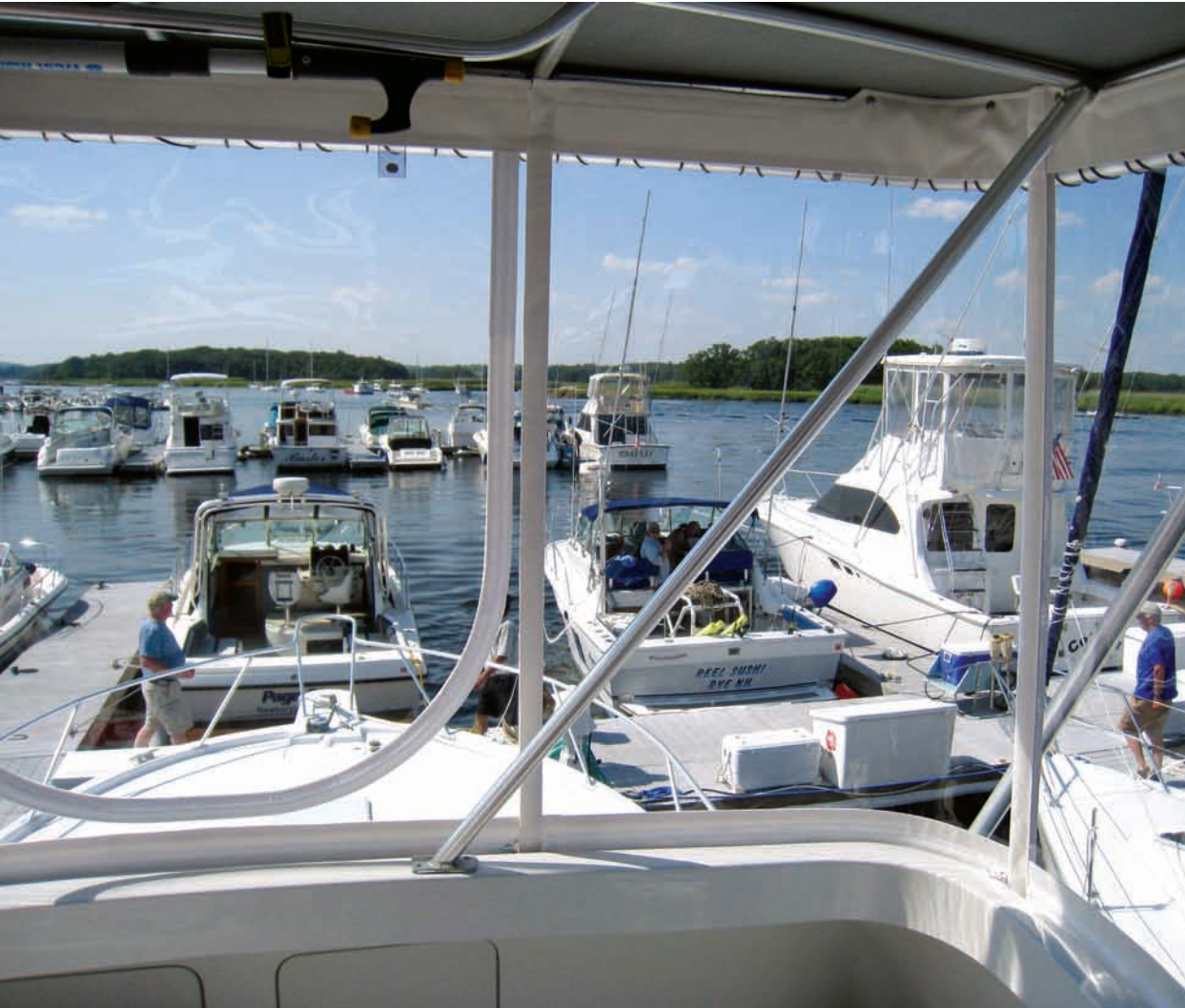
Inside view of a Hood Track to Track Enclosure on a Tiara 36. Notice how the tucks on the inside edge of the "smile" windows are barely noticeable.